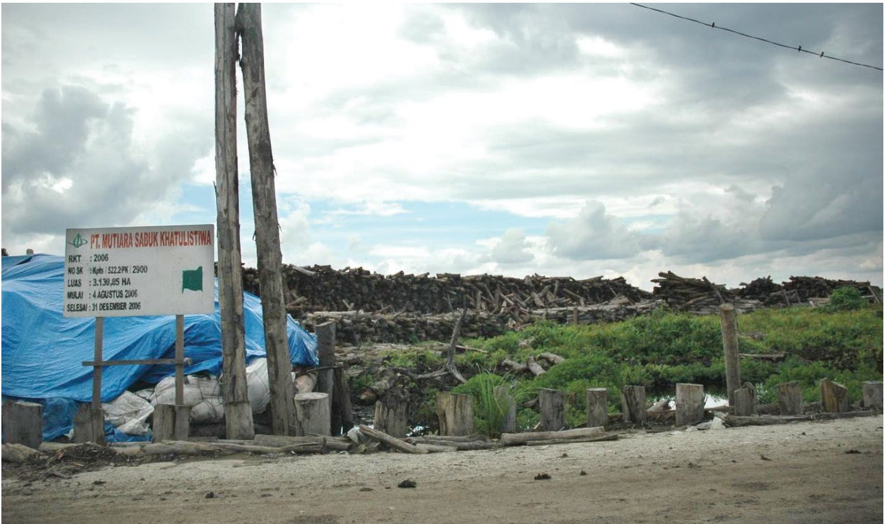
Pulpwood supplier PT Mutiara Sabuk Khatulistiwa

For another company reported to be controlled by Sukanto Tanoto, the beneficial owner is reported to be a corporation domiciled outside of Indonesia. PT Toba Pulp Lestari, which operates a pulp mill and pulpwood plantation in North Sumatra, reported its beneficial owner to be Pinnacle Company Pte Ltd, a holding company registered in Singapore (see Figure 3). 24 In this case, Indonesia’s regulatory instructions are clear that beneficial owners are natural persons, and this type of mis-reporting appears to violate Indonesia’s policy on defining and identifying the beneficial owner. 25